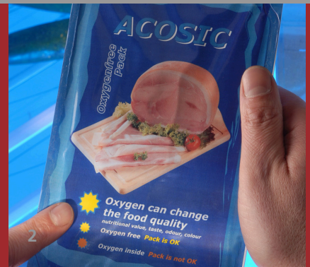
2 A possible active packaging concept containing an oxygen indicator as visible quality control for the consumer